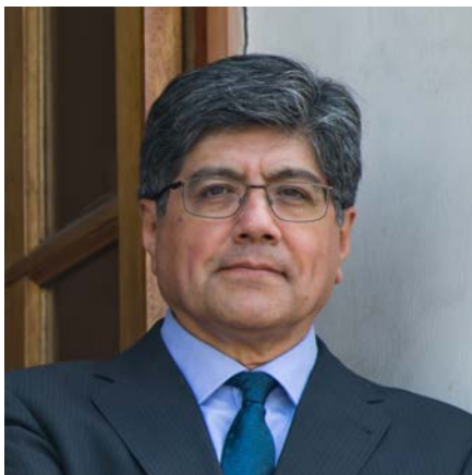
H.E. José Valencia

Minister of Foreign Affairs and Human Mobility of the Republic of Ecuador